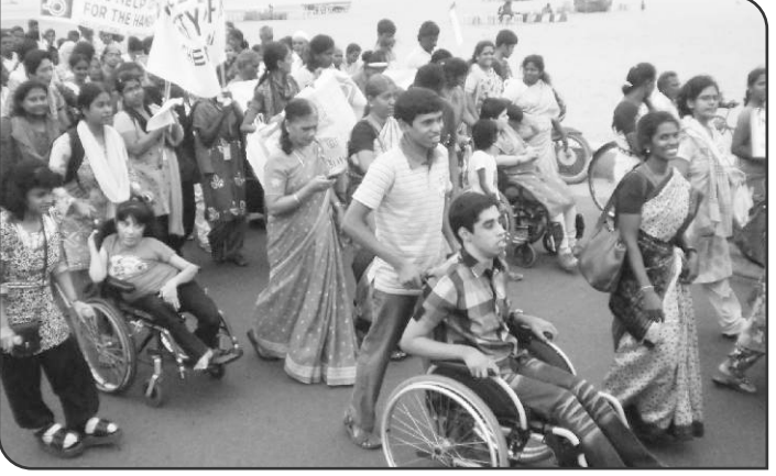
World Disability Day 2010 - Rally