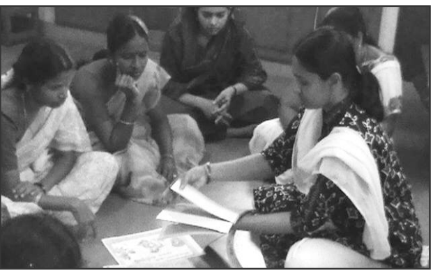
Parenting workshop Learning through Play