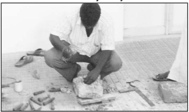
Artisan showing sculpting-Project day