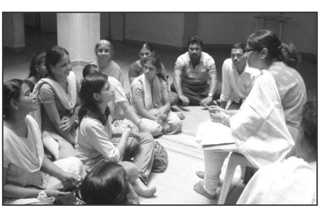
Parents workshop - Autism