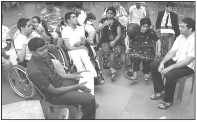
Young adults with Viswanath Anand at graduation ceremony