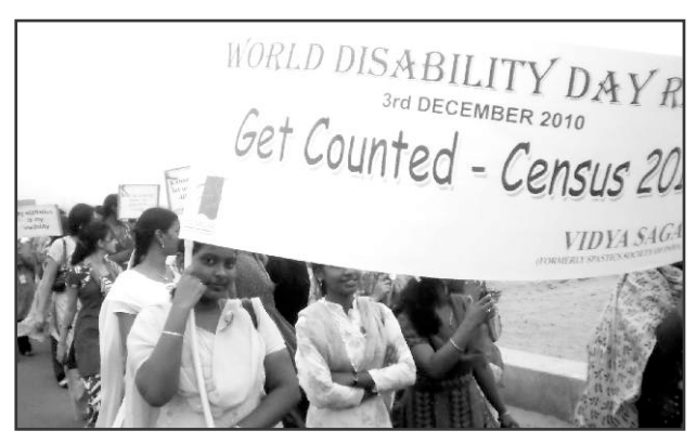
World Disability Day Rally Census 2011