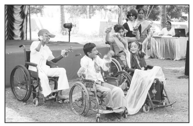
Vidya Sagar students at CCFC 'Talent Meet'

to a student for post operative care and rehabilitation. Vision screening at Frontline Hospitals and Mantoux test for the sponsored students.