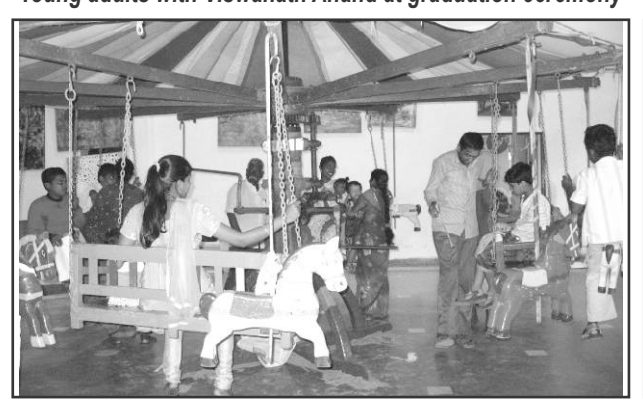
Chidrens Day Merry go round