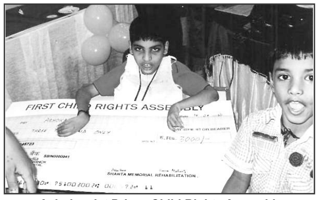
Ashokan Ist Prize - Child Rights Assembly