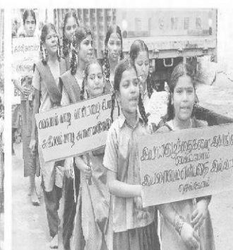
RALLIES: The events were held at Nungambakkam and (right) CIT Nagar.

ார்றுத் நிறர் அழத்தை ஆக்கான சிறப்பு உள்ளி விறிப்புளர்கு பெரணி, கி.ஜ.டி. நகர் மாநகராட்சி பார்கியில் தொடங்கி. நதல் பிரதான சாலைகளை சென்று கின்றும் பள்ளியை வந்தமைந்தது. பெரணியில் பங்கேற்ற மானைய, மாணகின்.