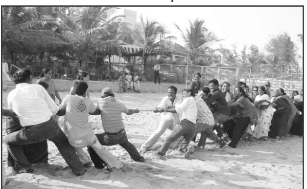
Staff picnic-Mamalla Resort