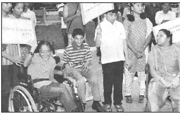
Newspaper clipping about the 'Street Play'