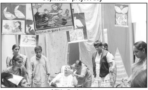
STU - Project day