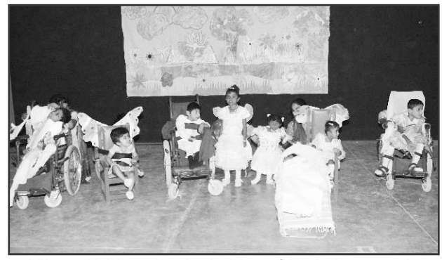
Vikasa-Tableau by the babies of Early Intervention