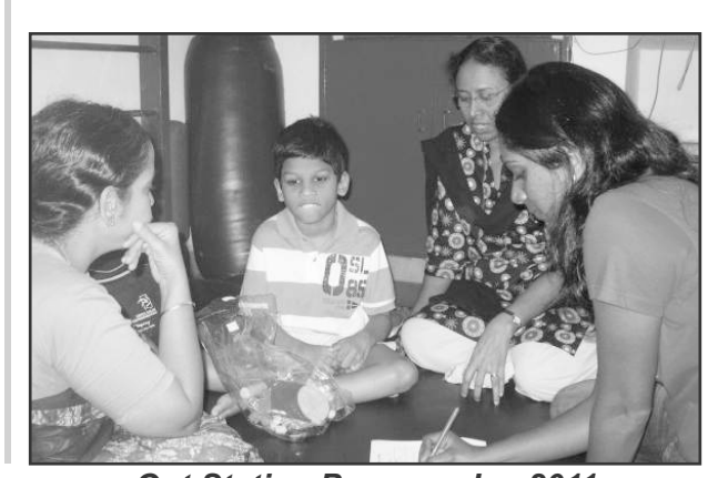
Out Station Program Jan 2011

All the children and parents participated in the Sports Day and the Carnival Day celebrations.