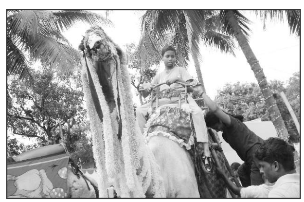
'Anjali' trip to Orissa

The CCFC team at Vidya Sagar won the 'Best Performance for Sponsorship Administration' for the year 2010-2011.