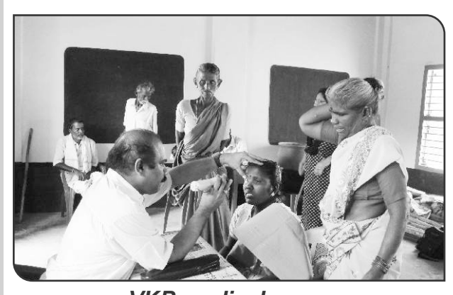
VKP medical camp

VKP has enabled Vidya Sagar to reach out to persons with disabilities and the community in the 59 villages.