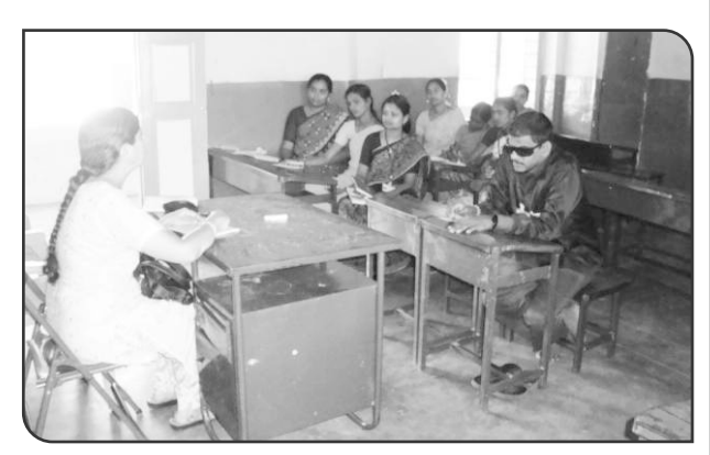
CBR-Amar Seva Sangam