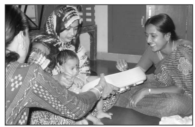
Out Station Program - Aug 2010

walk into class, identify their respective chairs and seating according to their seating arrangement. Each child has a communication chart which is used by the child to communicate. The feeding pattern of each child was assessed and improvements were planned and executed.