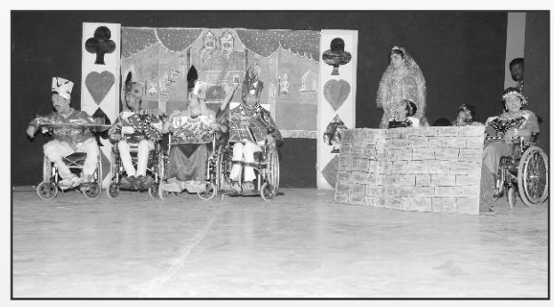
Vikasa-play by seniors

Parents meetings, workshops and open day were conducted periodically.