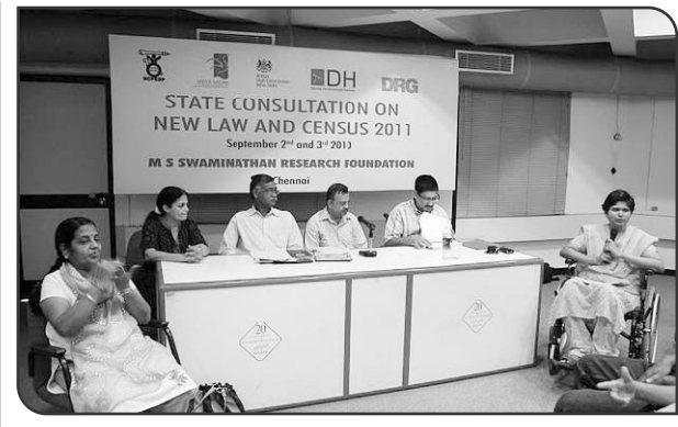
State Consultation on New Law & Census

Disabled People in Census 2011 on 3<sup>rd</sup> December 2010.