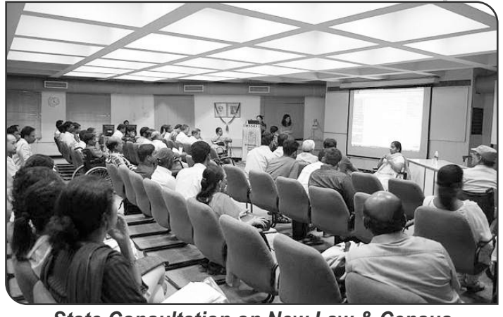
State Consultation on New Law & Census