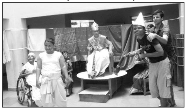
Project day play - project house