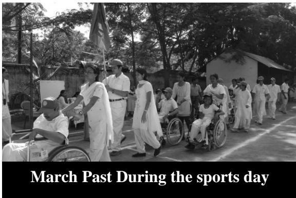
March Past During the sports day

The playground equipment sponsored by the Royal Bank of Scotland was inaugurated.