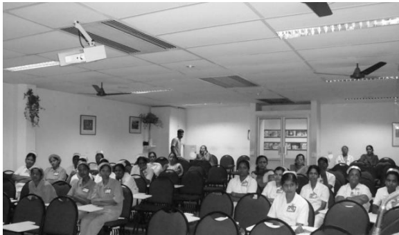
Awareness workshop at a hospital during AAC week

Two staff members attended a three day training program organized by Navajothi Trust on “Planning for comprehensive Rehabilitation of persons with Mental Retardation” in collaboration with RCI.