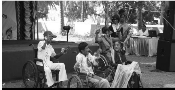
07.10.09 Our students at a Talent competition Attam Kondattam Conducted by CCFC