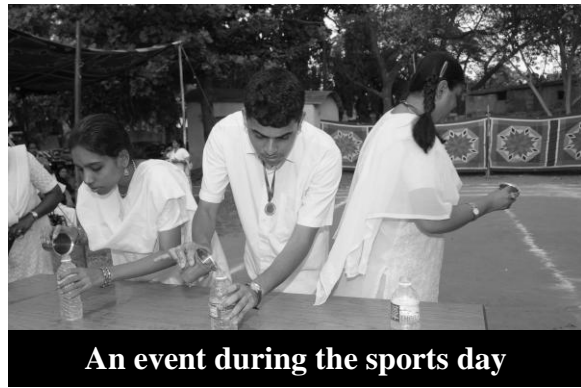
An event during the sports day