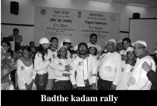
Badthe kadam rally