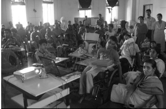
Inauguration of the AAC users' Forum

The 17 th batch of the Teacher's Training course, P.G. Diploma in Special Education, recognized by the Rehabilitation Council of India and affiliated to Madras University, was inaugurated.