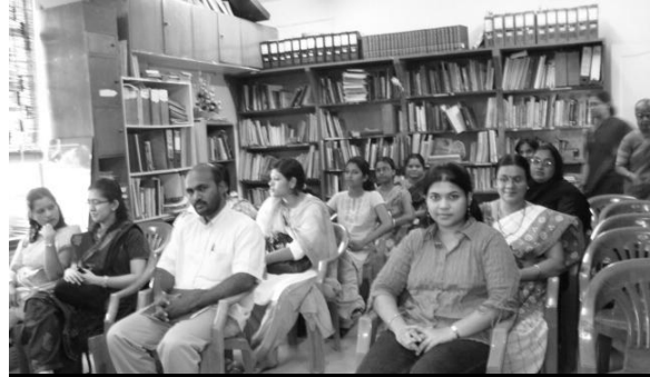
Inauguration of the Teachers Training Course