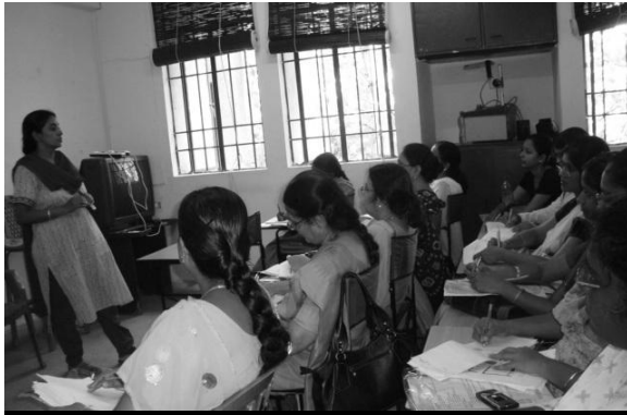
Session at the CRE course