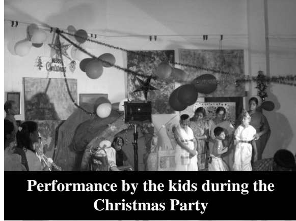
Performance by the kids during the Christmas Party