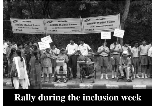
Rally during the inclusion week