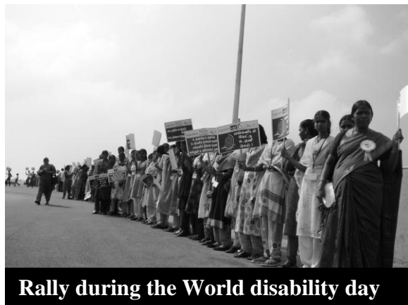
Rally during the World disability day

National Reading Together day was celebrated with “Scholastic”. The chief guest was Shri Shreekumar Varma , an author.